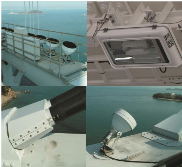
Long-span Bridge Ancillary Equipment Joint