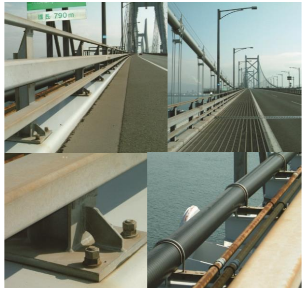
Long-span Bridge Road Equipment