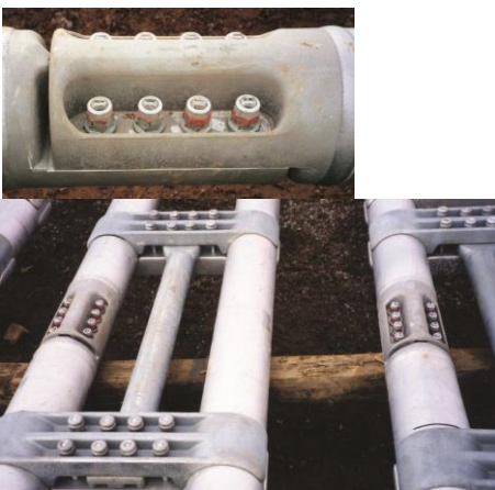
Transmission Tower Pipe Jumper