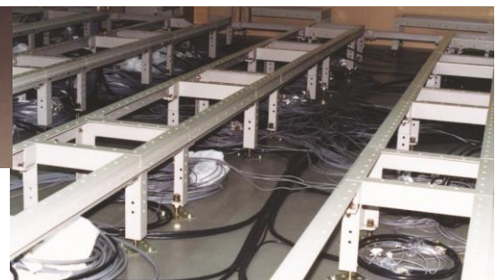
Steel Frame for Digital Equipment